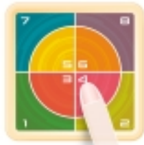
Up to 8 phrases

This mode allows you to play patterns and sound effects by touching the D-Field and includes the following function buttons: