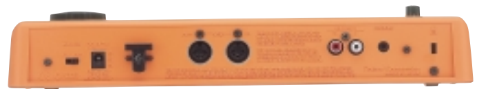
■ D2 Rear Panel

With the D2's Megamix function, it's easy to remix patterns into your own creations. Using the D-Field or Value dial, simply call up a phrase from one pattern, such as a bassline, and combine it with a phrase from another pattern. There are no rules, so you could take a drum 'n' bass rhythm and combine it with a piano riff from a house pattern. With the D2, anything is possible!