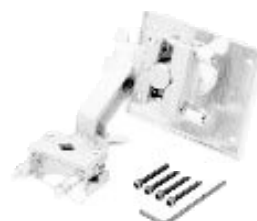
All purpose clamp set APC-33