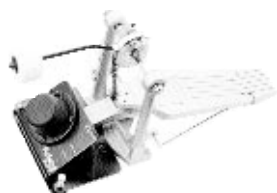
Kick Trigger Unit KD-7

Innovative mesh drum head and rubber-coated rim design offers dramatically improved response, sensitivity and silent performance.