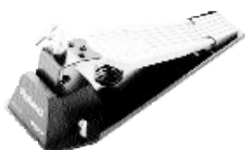
Hi-Hat control pedal FD-7