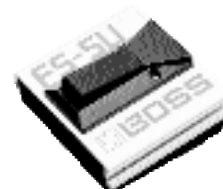
Footswitch BOSS FS-5U

Visit us online at http://www.rolandcorp.com/