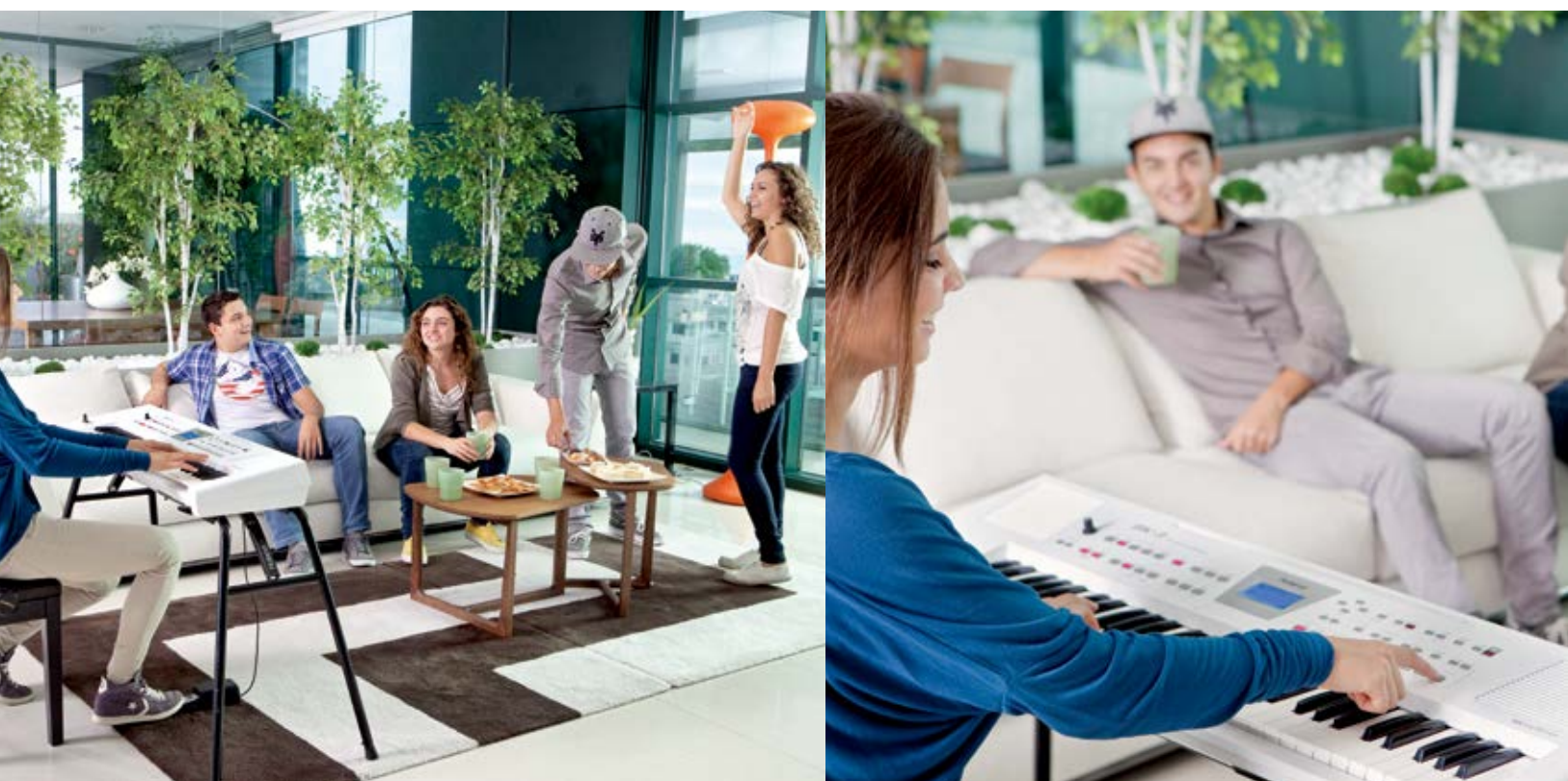
Location: NOVARREDO Showroom (Ripatransone, AP, Italy).

The BK-3 also allows you to record the user's performances in the connected USB storage device. The resulting WAV files can be played back on the BK-3 itself or transferred to a computer via a USB storage device.