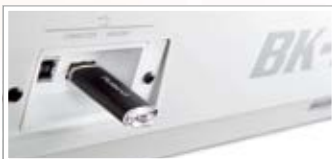
USB memory port.