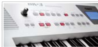
Left control Panel.