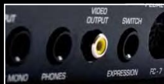
Composite video output.