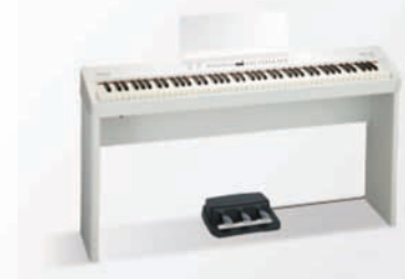
FP-4F-WH with optional KSC-44-WH and RPU-3