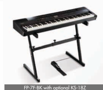
FP-7F-BK with optional KS-18Z