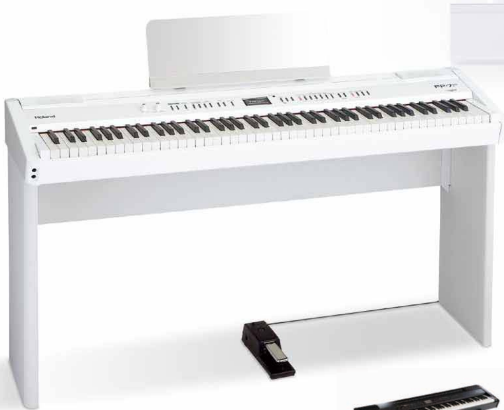
FP-7F-WH with optional KSC-44-WH

Stylish and portable, the FP-7F provides authentic piano tone, touch, and expression. Take the FP-7F anywhere, and experience the joy of music in your home, on stage, in your studio, or in the classroom.