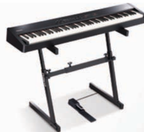
FP-4F-BK with optional KS-18Z