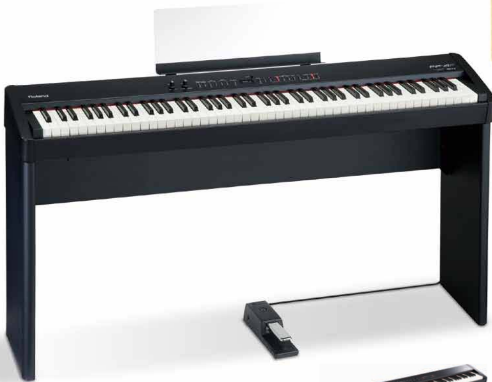
FP-4F-BK with optional KSC-44-BK

Authentic piano sounds, natural keyboard touch, and functions to expand your range of musical enjoyment are all packed into this compact keyboard. Take this instrument anywhere, and enjoy your music in any environment, from lessons to live performances.