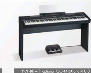
FP-7F-BK with optional KSC-44-BK and RPU-3