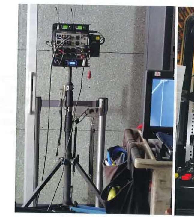
Digial Snake in action