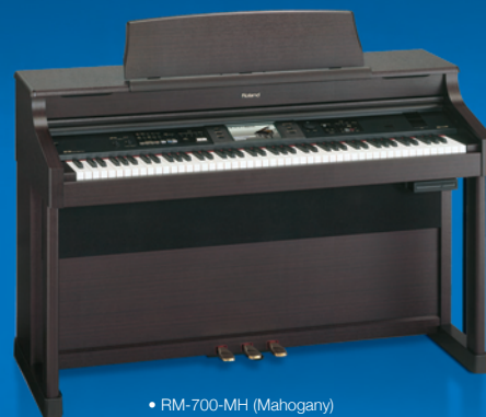
• RM-700-MH (Mahogany) Photograph shown with optional CD-01A USB CD Drive