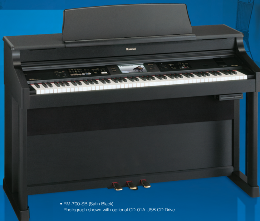
• RM-700-SB (Satin Black) Photograph shown with optional CD-01A USB CD Drive