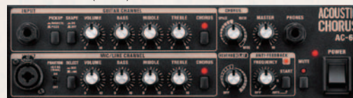
■ Control Panel (AC-60)