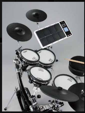
Incorporate an Octapad into your V-Drums to expand your system.

With the Octapad, you have instant access to a universe of sounds that span a broad range of musical genres. Simply by selecting from the onboard kits, and play! The Layer function let you layer, cross-switch, fade, or crossfade between sounds based on how hard you hit the pads. You can also customize the onboard sounds with the eight Inst parameters. Various multi-effects are built in, all specifically tuned for percussion and drum sounds. These effects help you expand the creative possibilities of your performances and custom sound design.