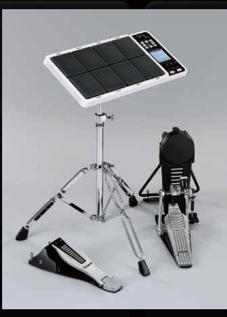
Mini drum system based on one Octapad. *Options (sold separately): Pad Stand PDS-10, Hi-Hat Controller FD-8 and Kick Trigger Pad KD-8